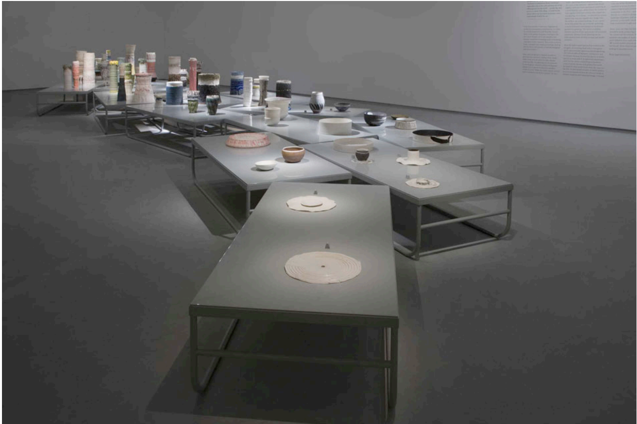
View of the exhibition.